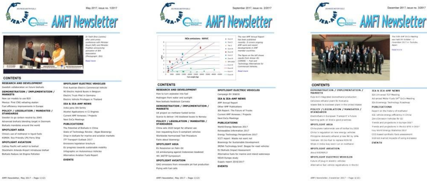
Fig. 1 AMF TCP Newsletters Published in 2017