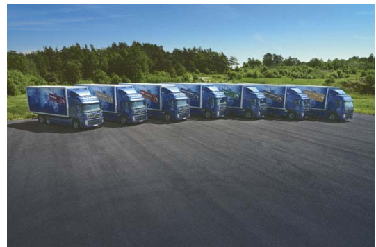
Volvo's renewable fuelled trucks