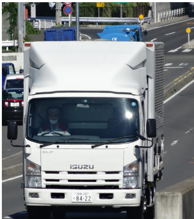
First DME Truck Registered in Japan

The AMFI Newsletter is prepared for the members of the Implementing Agreement for Advanced Motor Fuels of the International Energy Agency (IEA/AMF). The AMFI releases four electronic newsletters each year.