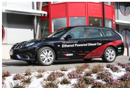
Ethanol powered diesel car. Photo with courtesy of BSR ( http://www.e95.eu/ ).

The world's first diesel car using ethanol was exhibited at the Malmö Motor Show. BSR has optimised a Saab 9-3 diesel car for E95 (95% ethanol) fuel. This project is carried out together with SEKAB in Örnköldsvik, a producer and distributor of Bioethanol, and with the EU project BEST (Bioethanol for Sustainable Transport). This car equipped with a combustion chamber, fuel system and engine software shows reduced fuel consumption, high performance and low exhaust emissions. Source: BSR news, 26 March 2008. ( http://en.bsr.se/news/219 ).