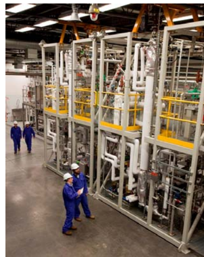
Virent's biogasoline demonstration. Photo with courtesy of Shell.

Virent's patented BioForming® platform technology uses catalysts to convert plant sugars into hydrocarbon molecules resembling those produced at a petroleum refinery. Traditionally, sugars have been fermented into ethanol and distilled. Virent's 'biogasoline' fuel molecules have higher energy content than ethanol and deliver better fuel economy. They can be blended seamlessly to make conventional gasoline or combined with gasoline containing ethanol. Source: Shell Press Release, 23 March 2010. ( www.shell.com ).