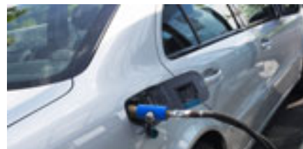
Methane car at filling station. Photo by courtesy of FordonsGas.

The Nordic Ecolabel is the official Nordic environmental award given to products and services that fulfil stringent environmental criteria. FordonsGas Sverige AB runs gas filling stations in Sweden. Source: Miljömärkning Svanen, 11 November 2008 (www.svanen.nu).