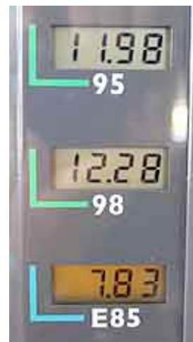
Figure: Tidskriften Analys & Kritik ( www.analyskritik.press.se )