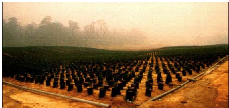
Palm oil plantation in Indonesia (fires in background)

Commenting the new strategy, the European Environmental Bureau (EEB) warns about strong promotion of biofuels without certainty of the effect of feedstock production on the environment in the EU or in developing countries. The EEB is also concerned of the possibility that the CO 2 benefits of biofuels result in less pressure on the more fuel-efficient cars. Agriculture Policy Officer at the EEB calls for "a compulsory certification system for environmentally sound biofuel production, accompanied by reliable traceability". ( www.eeb.org ).